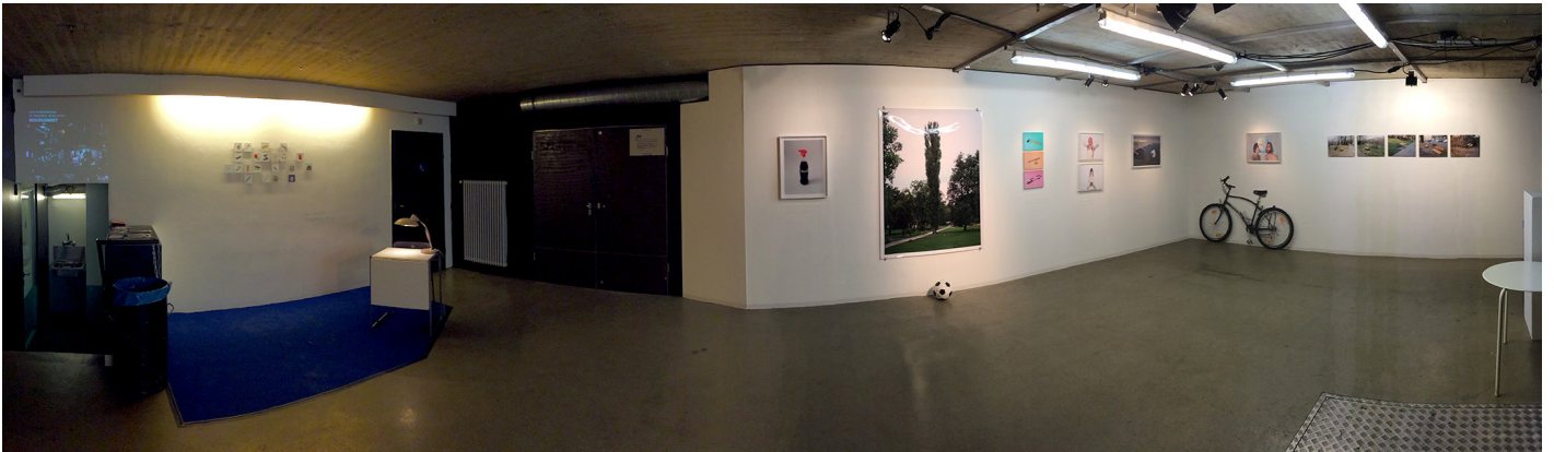
“Objective perspective!”, group show in Brut, Vienna, 2014