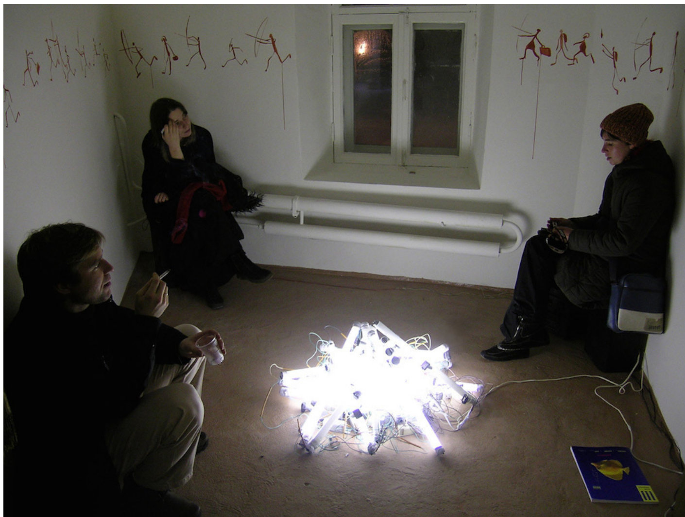
“ABC gallery”, exhibition space founded by artists from ABC group, Moscow, 2004-2009