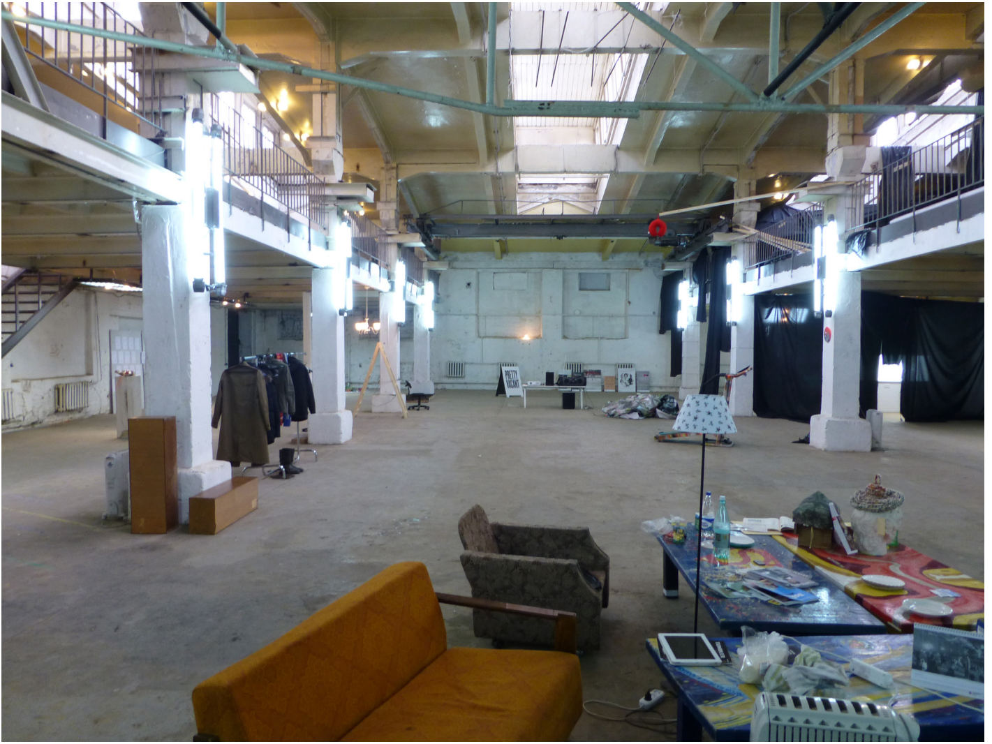
“Hotel Moscow”, exhibition of 21 artists from Moscow and Leipzig, ArtPlay design center, Moscow, 2013