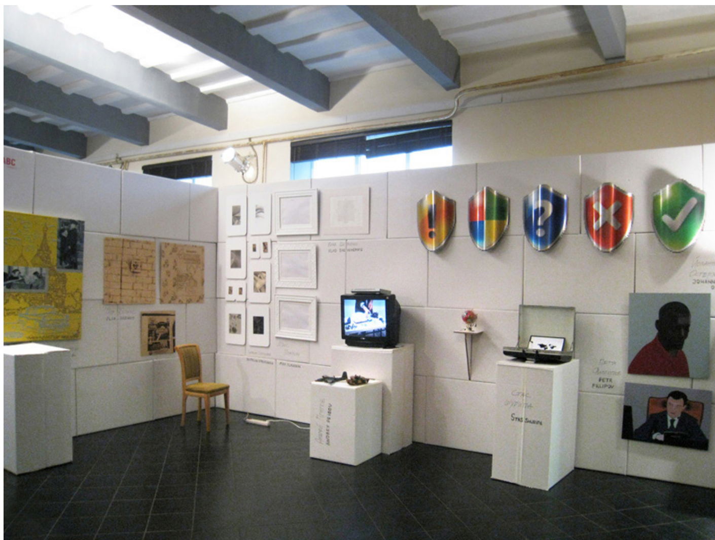
“UNIVERSAM”, artist-run art fair, Moscow, 2009