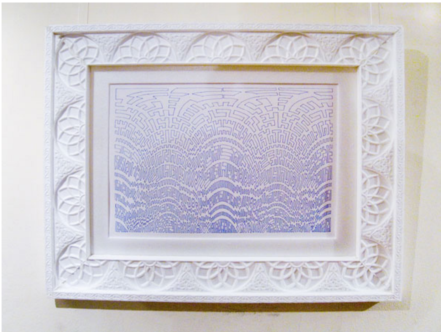
“Pre Press”, series of 12 sheets, 30x40 cm, gel pen on paper, in authors hand-made frames, 2006