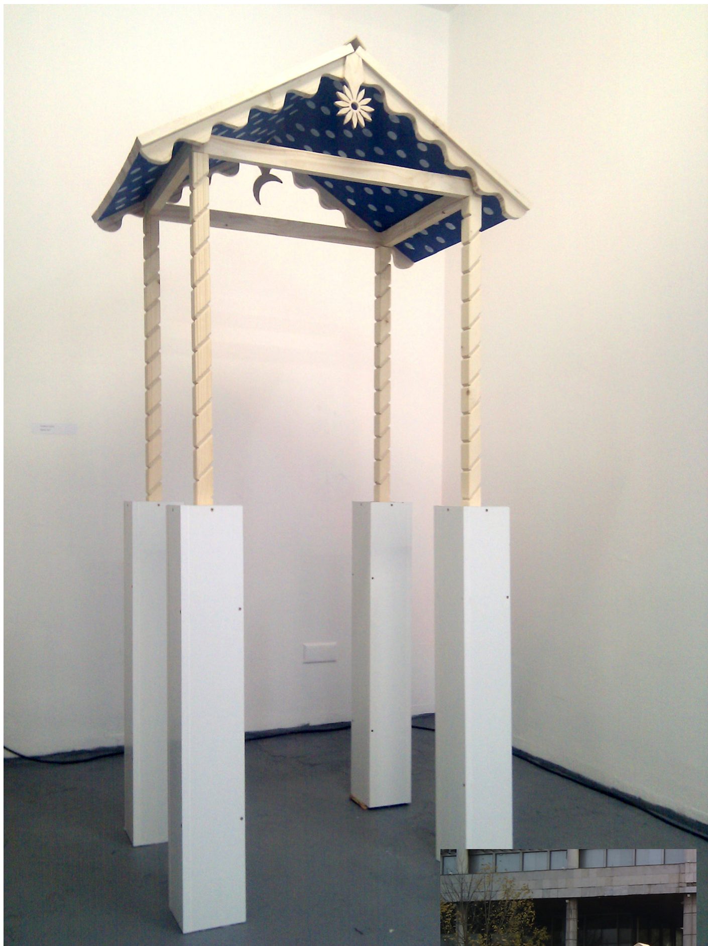
"Heaven". Object, 220x80x70 cm, wood, acrylic color, 2011