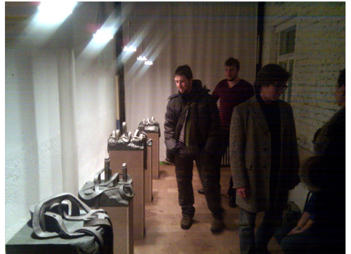
“OFIS”, artist-run gallery and studio in the same location as the architectural office, Moscow, 2011-2013