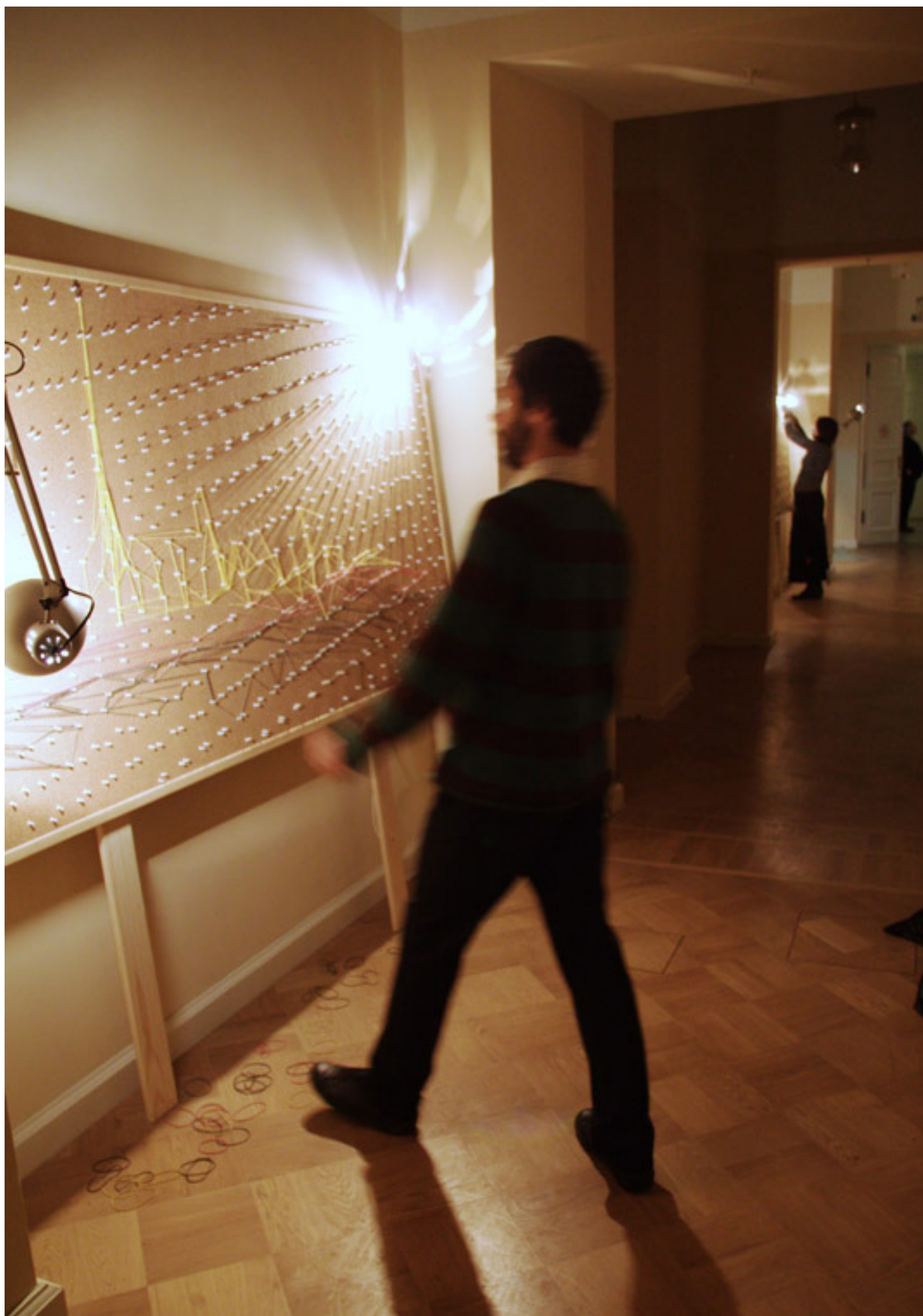
"Message board". Interactive object, 150x240 cm, polywood, cork, pins, rubber rings, 2011