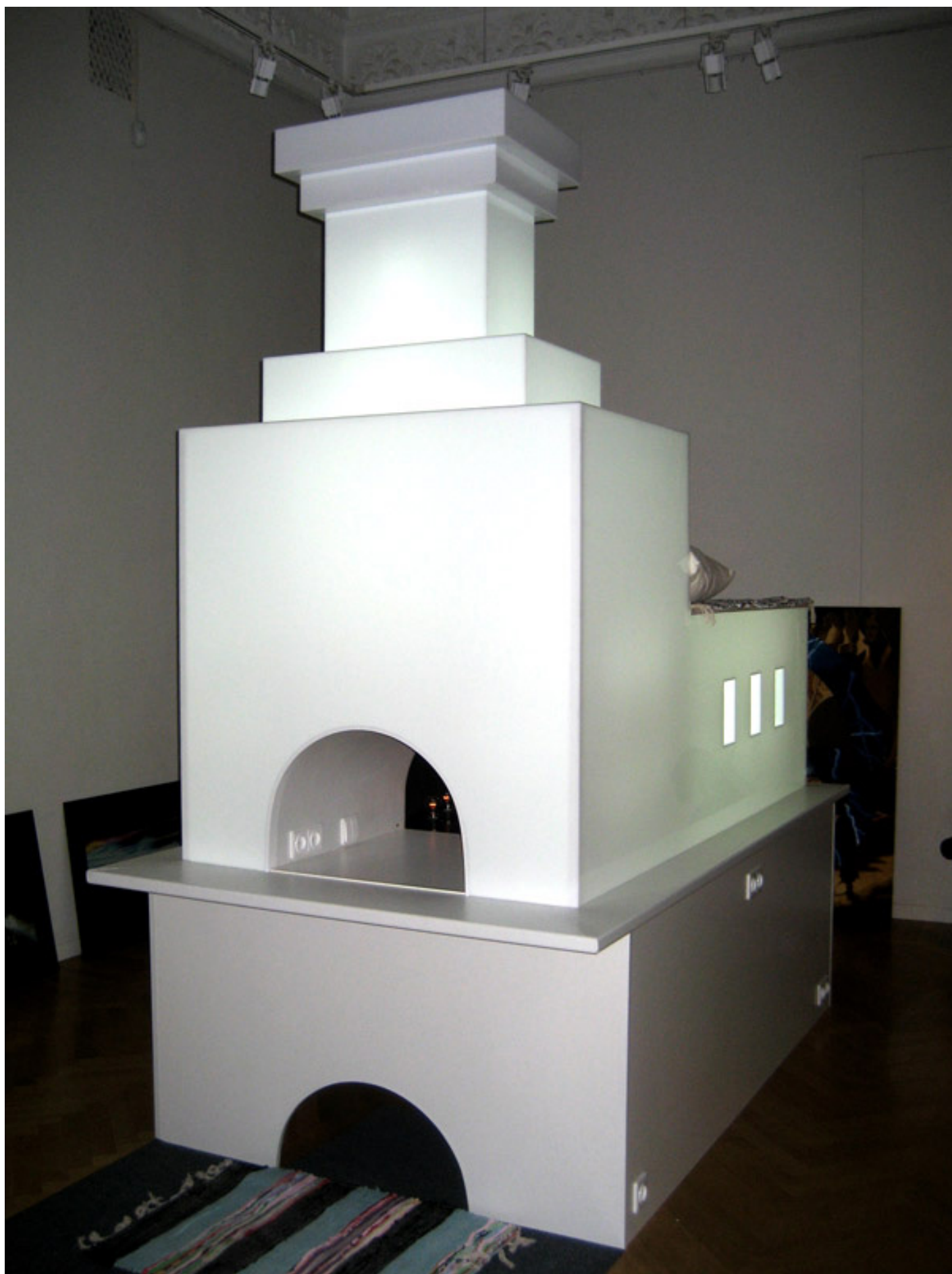
"i-daPech". Object, 270x160x300 cm, plastic, chipboard, lamps, wires, switches, sockets, 2007